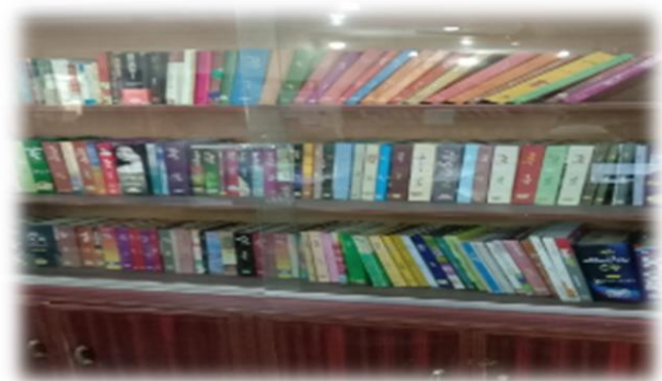
Library of RWO for providing free of cost access toward education and Knowledge

During the year 2021 Roshni sustained and maintained the Library, and also increased the number of books. ROSHNI had a lot of books, reports, success stories of women, and booklets from different organizations. ROSHNI requested SHIRKAT GAH for the library so they sent many books concerning women's issues to Library. So ROSHNI established a mini Library in 2000. There visitors can enjoy reading the books about General knowledge, women's issues, general information about human rights, useful websites, addresses of different authors, syllabus, and guide books. Now the library has more than 1400 books. Also, beneficiaries issue the books from the library.