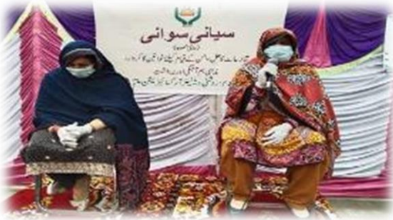
Through Cultural Festival community women created the equal space for diverse group to peace building and social Harmony