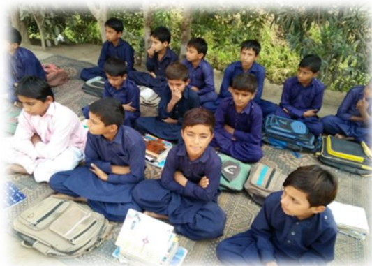
Figure 1 Students of Non-Formal School

To enhance the RWO staff, volunteers, and community information and knowledge on Gender centered, RWO established the bookshelves. These shelves have consisted of more than 200 books. Books related to genders and their role in different segment field of life included in these shelves.