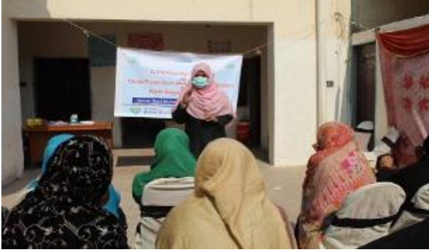
Awareness Session at Basti Arjawine Sharief Uc Muhammad Pur Ghatta, to enhance Birth Registration of target Areas