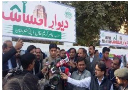
Launching of DEWAR-AHSAS for deserving people of Multan

collaboration of Social Welfare. In this project, ROSHNI conducted an introductory session on the DEWAR-AHSAS different areas and selected the wall of the Sanatzar; the purpose of this project was to sport needy people. To support those people who cannot purchase new clothes and shoes. People hung their cloth, sweater, shall, etc on the wall and needy people were taken away.