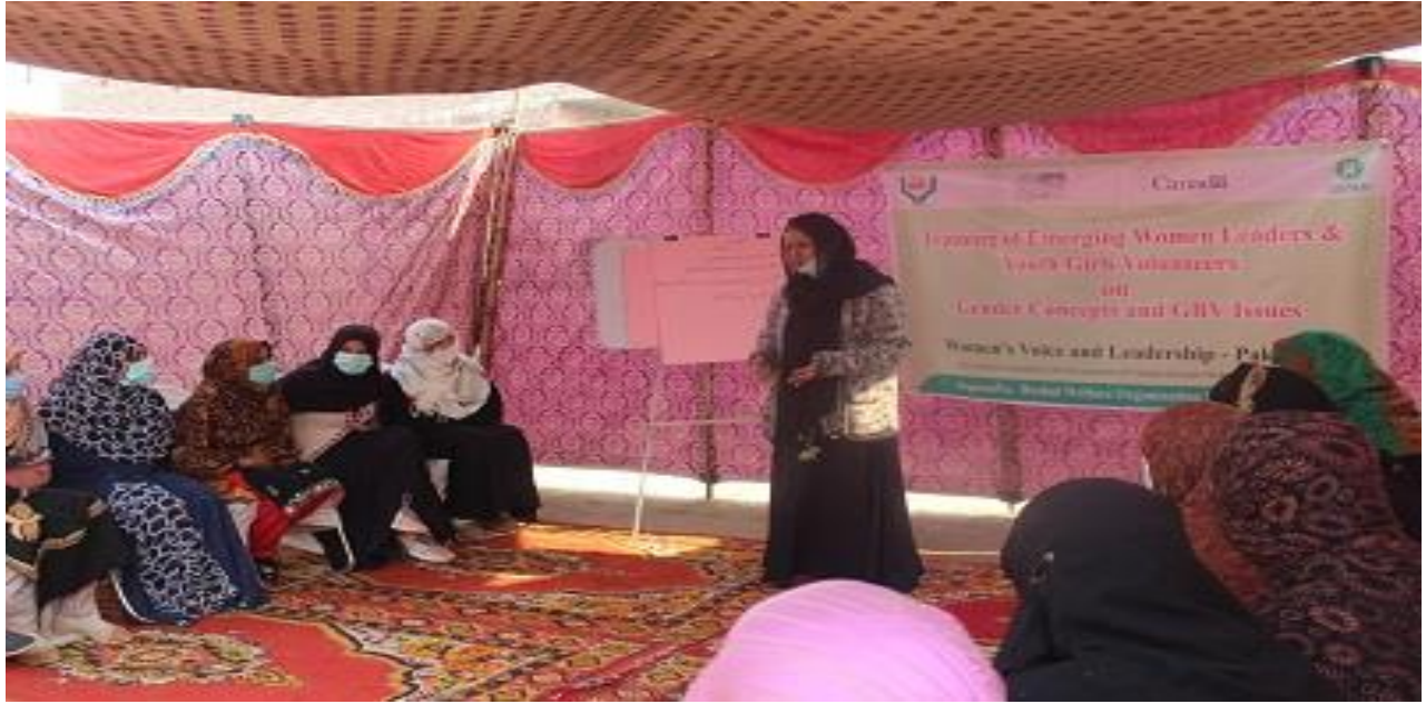
Training of Youth Volunteer on Gender Based Violence and Issues