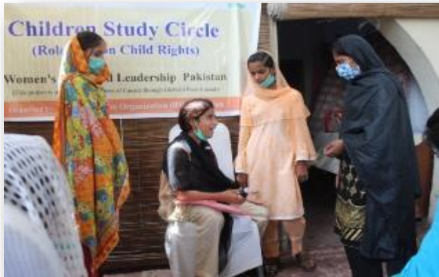
Childre Study Circle (Role Play)