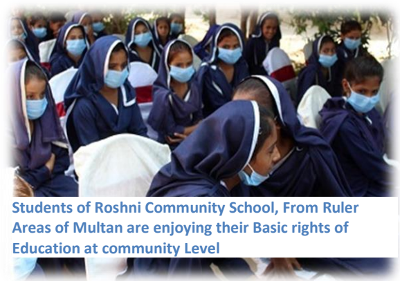
Students of Roshni Community School, From Ruler Areas of Multan are enjoying their Basic rights of Education at community Level

During the year 2021 ROSHNI also sustained